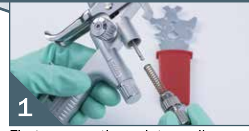
First remove the paint needle