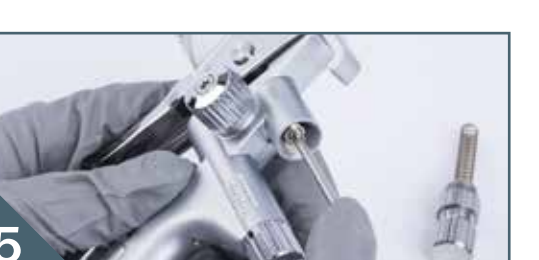
Insert paint needle