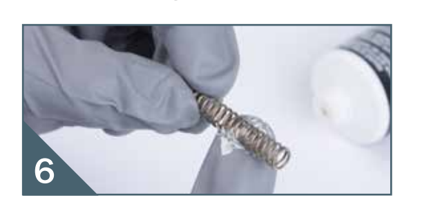
Grease and insert paint needle spring